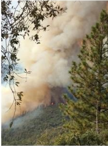
Lumpkin Fire Photo

Fall is finally here with a bit of rain and the leaves changing to those beautiful red, yellow and orange colors! Thanksgiving's just around the corner. A bit of a hectic year for WM and me. It has been a hot and worrisome summer. The threat of fire has been great and our own little Lodge was in the evacuation alert area at one point during the Lumpkin fire. Several of our members were also in the area and we are most grateful that they were safe. We were blessed that, unlike other fires, the Lumpkin fire was contained at just over a thousand acres. So thankful that we have received some much needed rain and more is in the forecast.