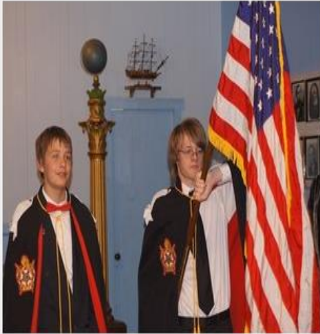
The gentlemen from DeMolay present our nations flag.