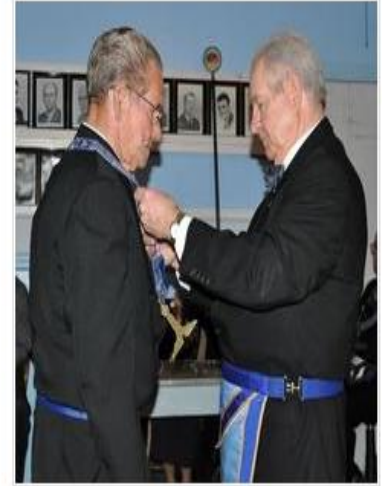
Our Senior Warden presented with his collar.