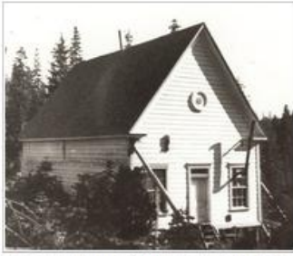
Last meeting place of Jefferson Lodge before it consolidated with Forbestown No.50